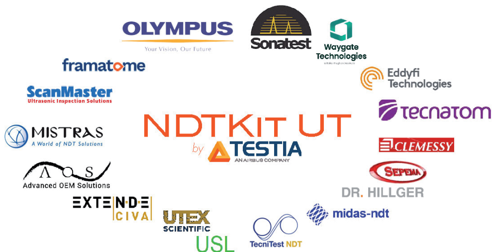
List of partners which provide UT instruments &/or UT software compatible with NDTkit UT

NDTkit UT can work as a common diagnosis tool and help users on the challenging task of using acquisition data coming from many devices, be it portable or fixed; the software simply needs to read the external file to start the analysis.